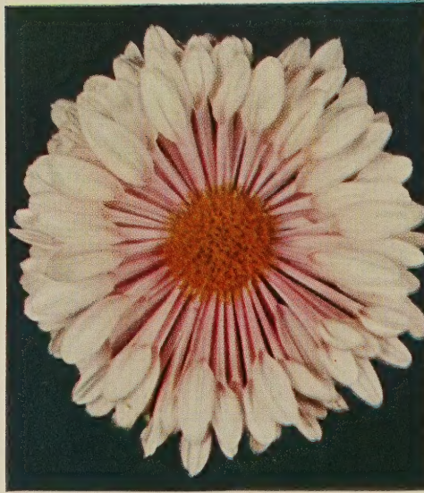
BLUSHWHITE. 60c each; 3 for $1.50